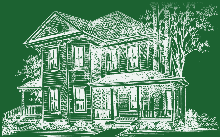
Pee Dee Coalition - Marlboro Satellite Crisis Center

Another grant recipient, The Humane Society of Marlboro County, shared what the recent grant meant to their organization, stating, "This grant is specifically used for our Spay/Neuter Program. We would like to thank the Kinney Family Fund for once again supporting our cause. We are honored and beyond grateful to be awarded this. Without this grant, we would certainly be much more limited in the number of spay and neuter surgeries we have completed, which would mean more abused, neglected and diseased animals roaming our streets."